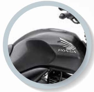
Mat Axis Gray Metallic