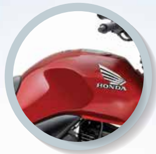
Imperial Red Metallic