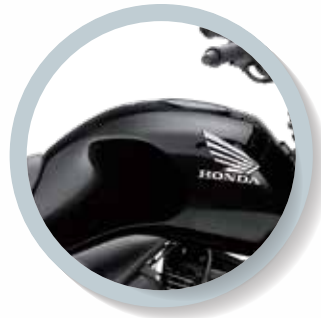
Pearl Igneous Black